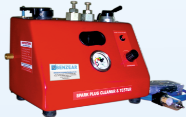
CLEANER AND TESTER SPCT