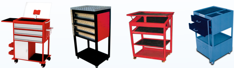
BTT-H-C BTT-Y-SS BTT-H BTT-3R