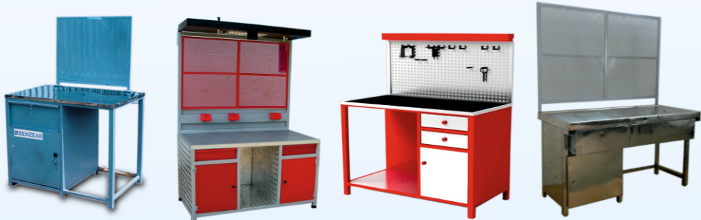
BWB BWB-Y BWB-H BWB-SS

Reliable Equipments for 2&3 Wheeler Workshops